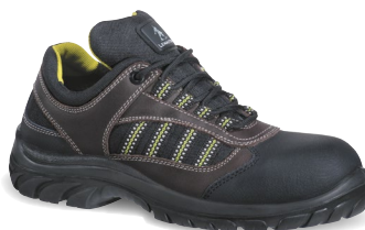
Douro S3 SRC DOURS30BR